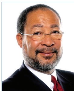
Richard D. Parsons,

Senior Advisor, Providence Equity Partners, Inc. (Chair of the Task Force)